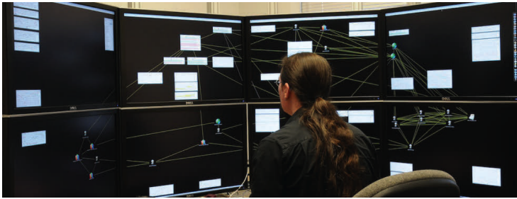
Fig. 4: Space to think: An analyst is immersed in a large sensemaking space, organizing a schema of textual data in collaboration with machine learning algorithms [2, 4].

A key challenge is designing immersive interactions that provide relevant input to computational analytics and designing computational analytics that appropriately support such user feedback [35]. One of the principles of Semantic Interaction [18] is to exploit existing cognitive operations that sensemakers naturally apply in physical environments, such as organizing and annotating, and re-casting these cognitive-level interactions into low-level feedback required by computational algorithms. Since these interactions are likely to be incremental in nature, it is important that the algorithms are designed such that they (1) do not require complete specification of all parameters up front, and (2) support incremental model learning [49].