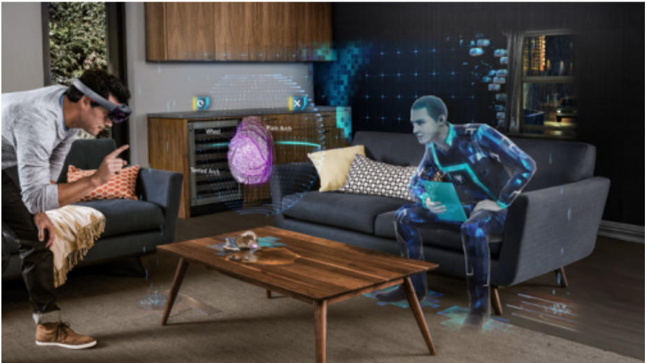
Fig. 1: The Hololens Fragments game allows deeper exploration of a scene using alternate 'lenses'.